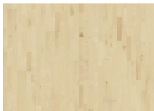
European Maple Gotha